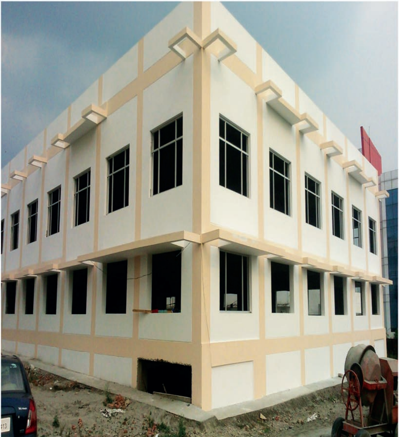
CONSTRUCTION OF FACTORY BUILDING REGAL INFORMATION TECHNOLOGY AT PLOT NO. 31 IT PARK, DEHRADUN