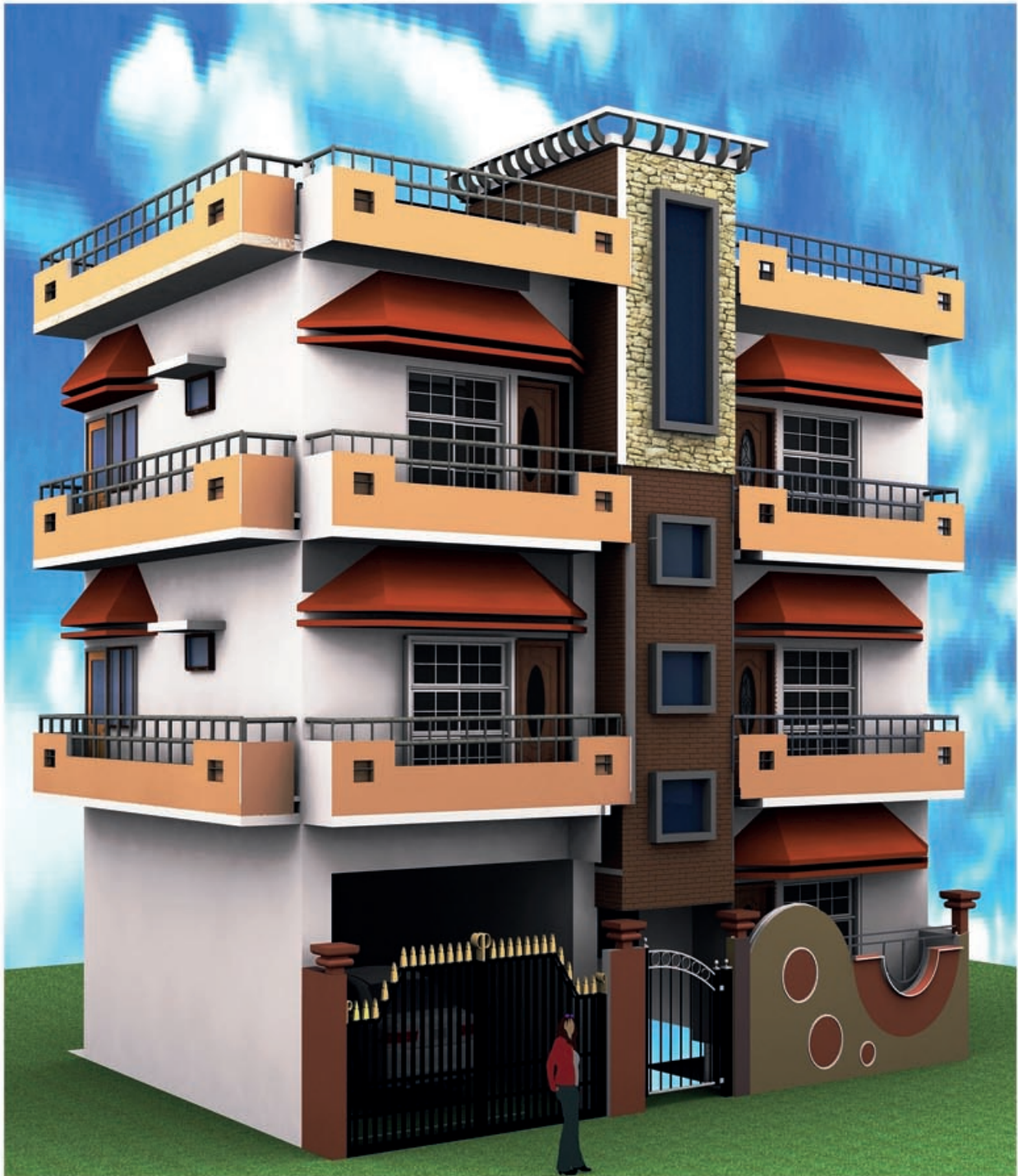
KRISHNA HOME - 1 THDC COLONY, DEHRAKHAS - DEHRADUN