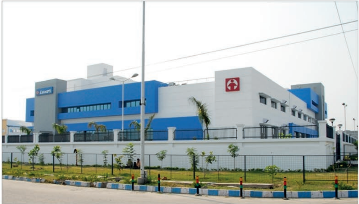
LUXOR WRITING INSTRUMENT, SIDCUL - HARIDWAR