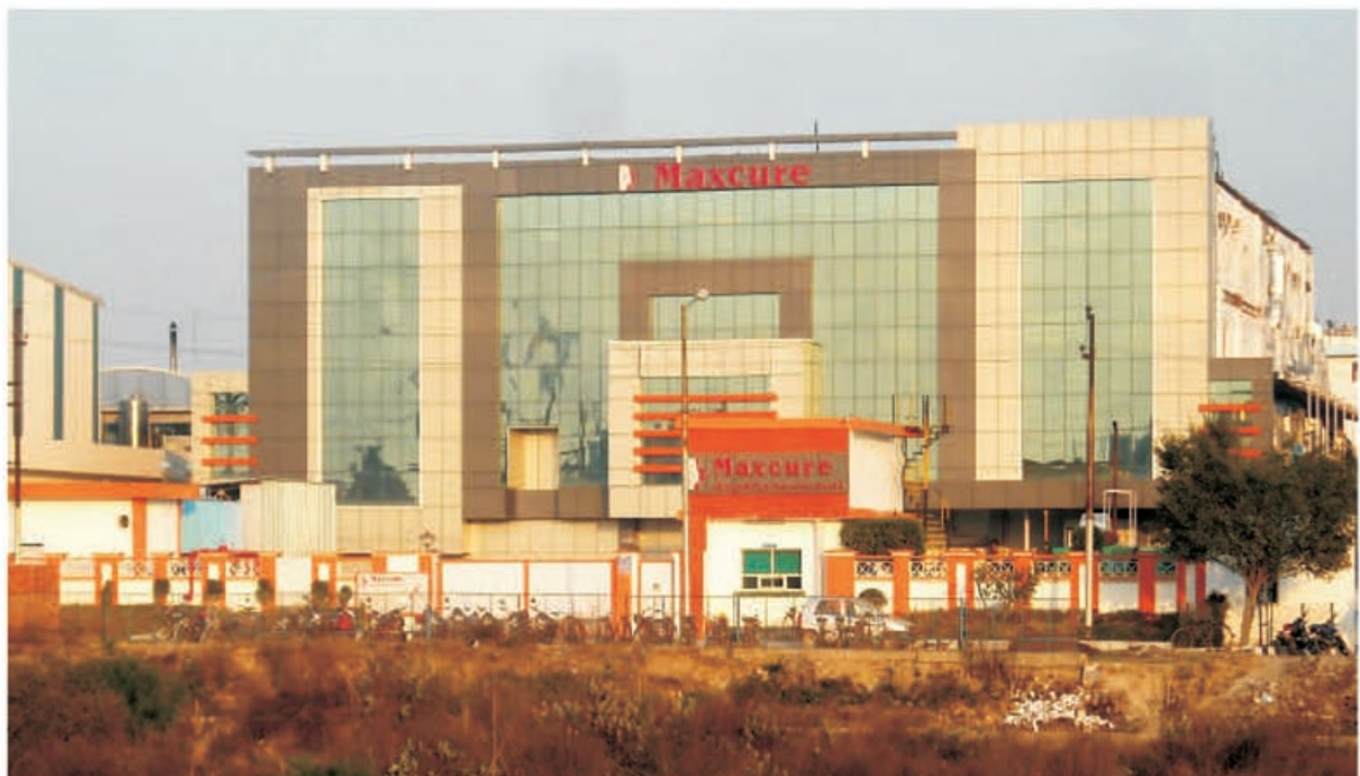
MAXCURE PHARMACEUTICAL LTD. AT SIDCUL RANIPUR HARIDWAR. (AS A CONTRACTOR)