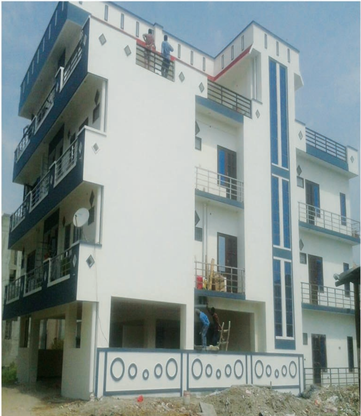
KRISHNA HOME - 3 THDC COLONY, DEHRAKHAS, DEHRADUN