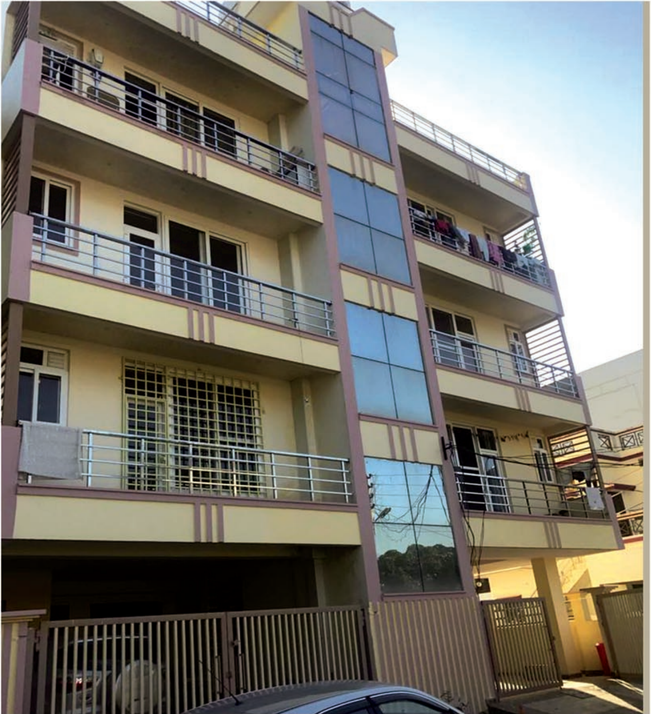
Residential Building at sahastradhara Road, Near IT Park, Dehradun - UK