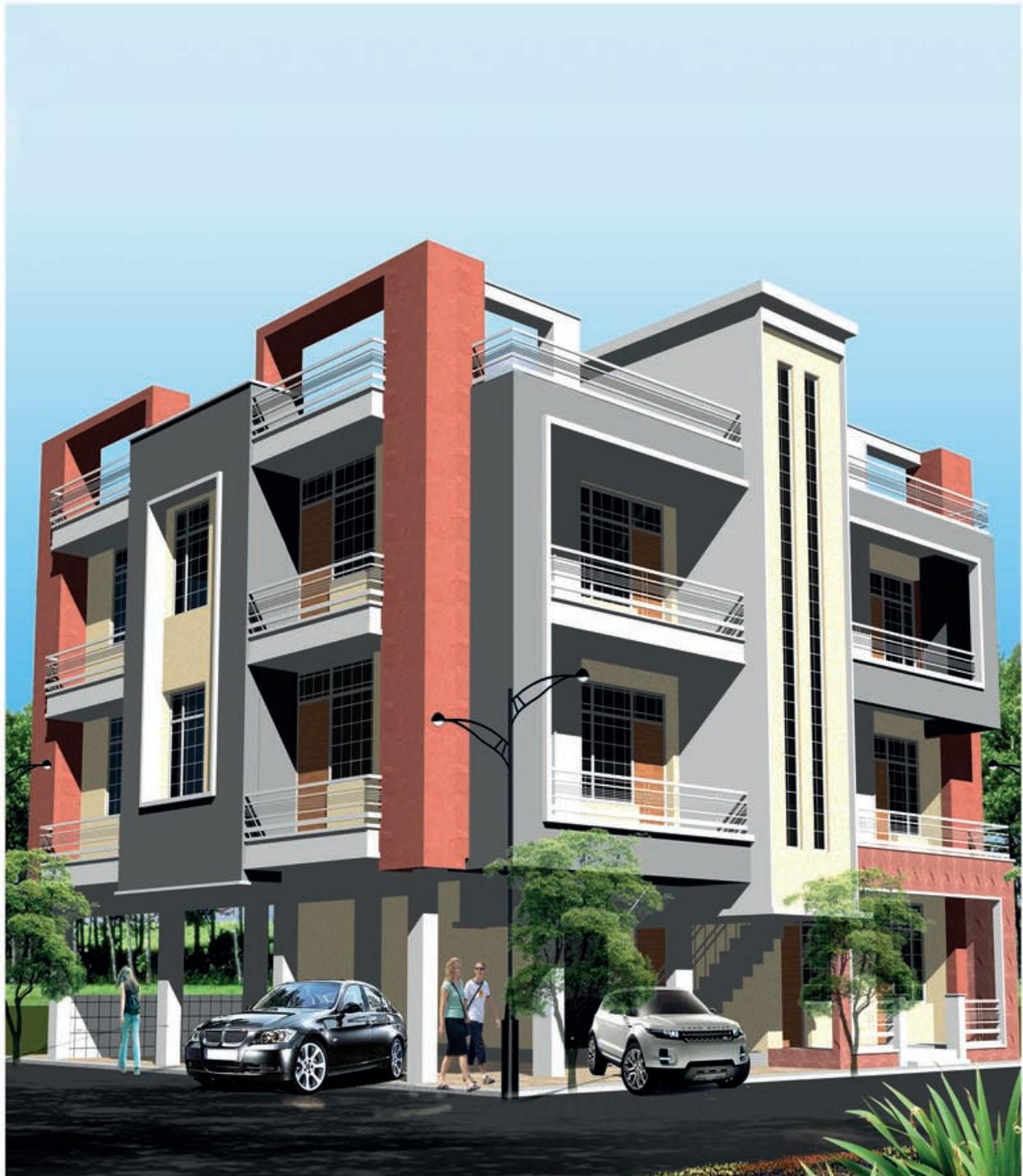
KRISHNA HOME - 2 MULTYSTORY BUILDING AT BLOCK NO. 65 A THDC COLONY, DEHRAKHAS, DEHRADUN (AS A DEVELOPER)