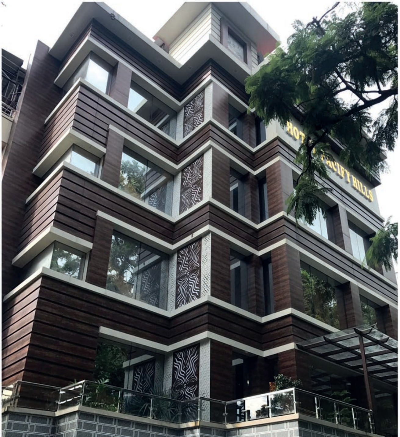
Hotel Pacify Hills, at Kauthal Gate Mussoorie Diversion Road, Dehradun - UK