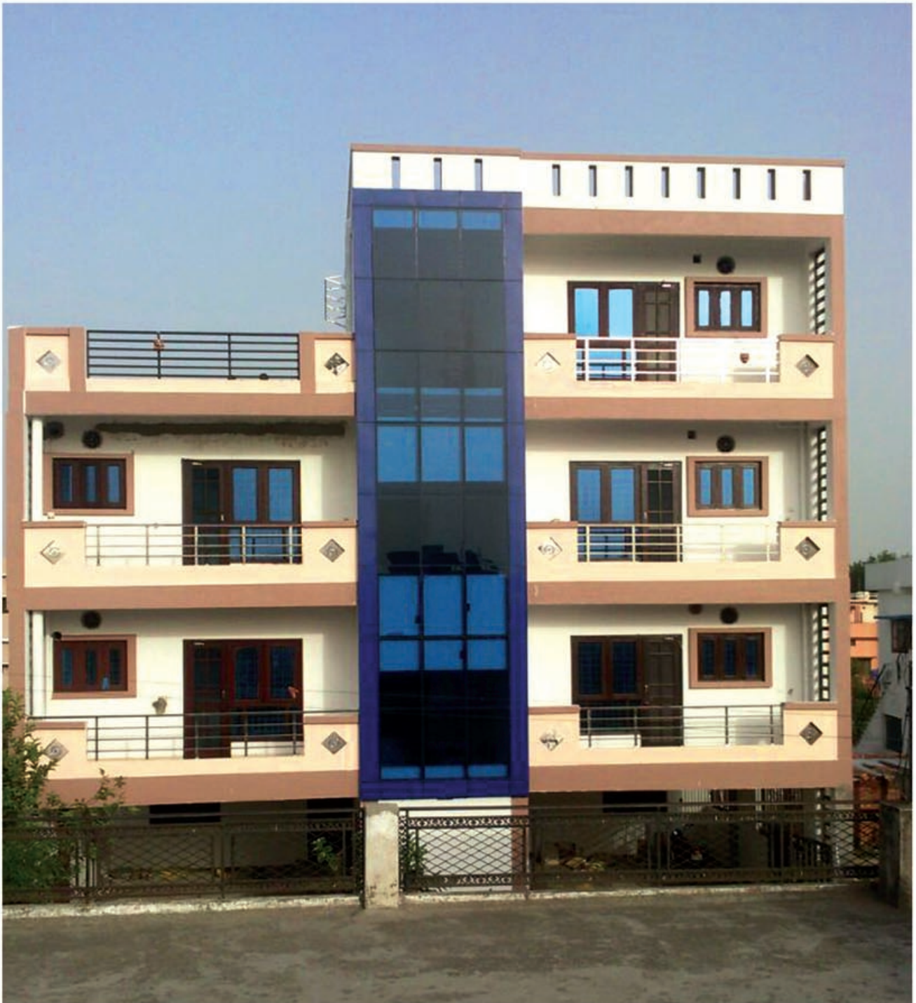
KRISHNA HOME - 6 BLOCK NO. 58, DEHRAKHAS , DEHRADUN