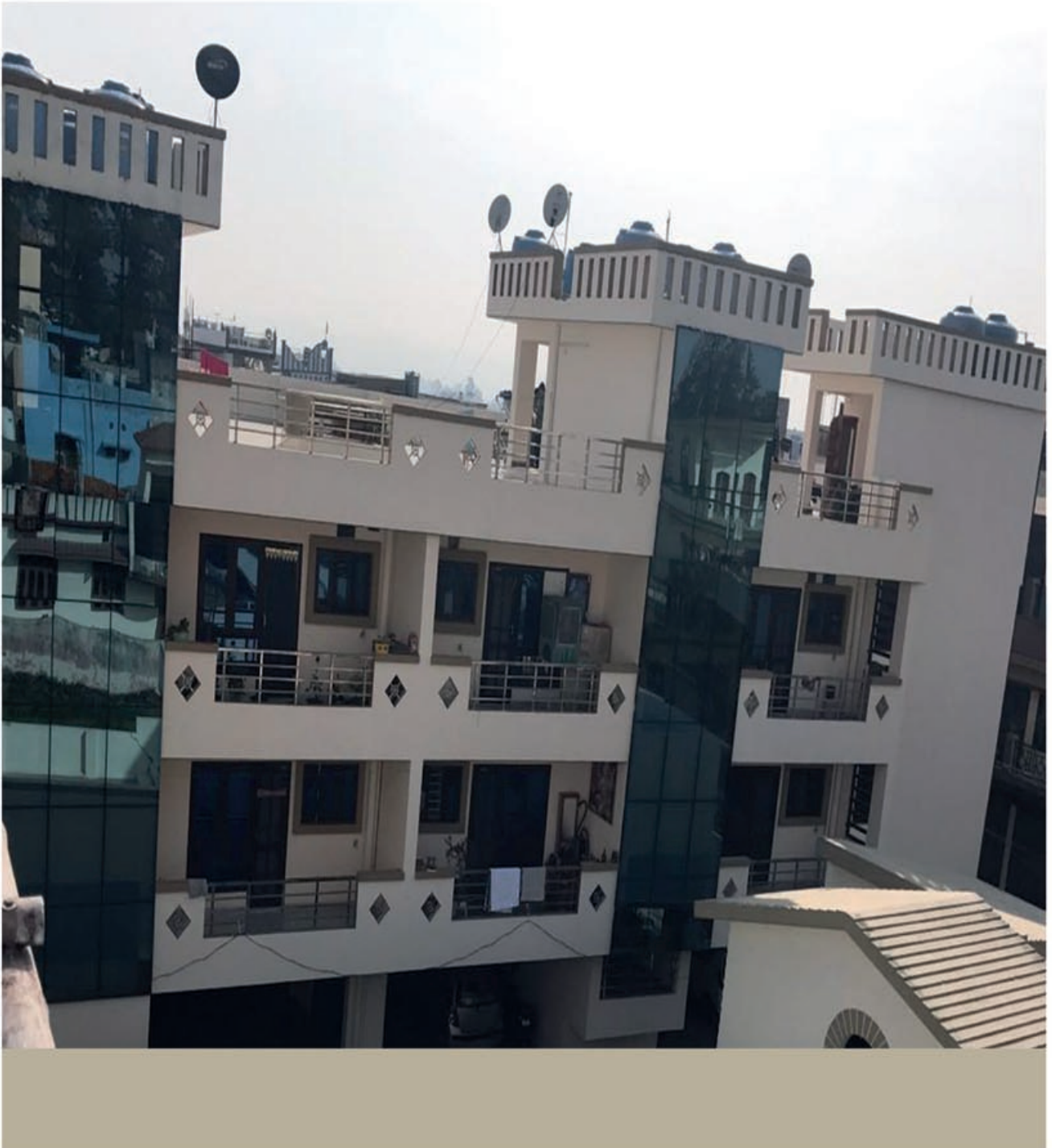
Residential Building at Block 58, THDC Colony Dehradun - UK