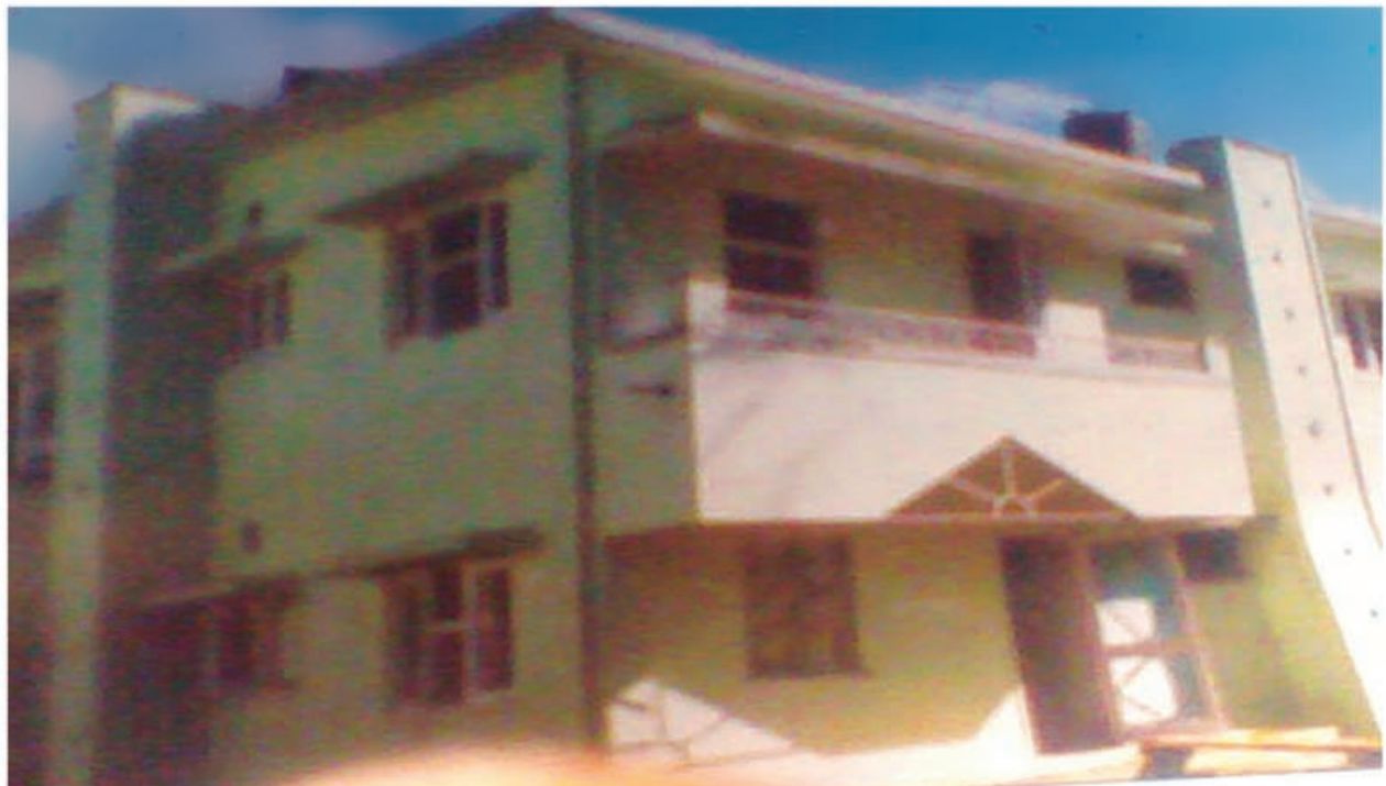
SECRETORY RESIDENCY AT RAJPUR ROAD - DEHRADUN