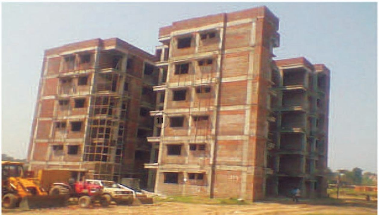
AIIMS - RISHIKESH