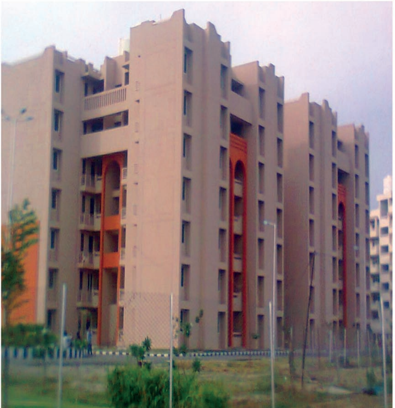
GROUP HOUSING PROJECT AT ROSHANABAD, SIDCUL, HARIDWAR (HERO GROUP)