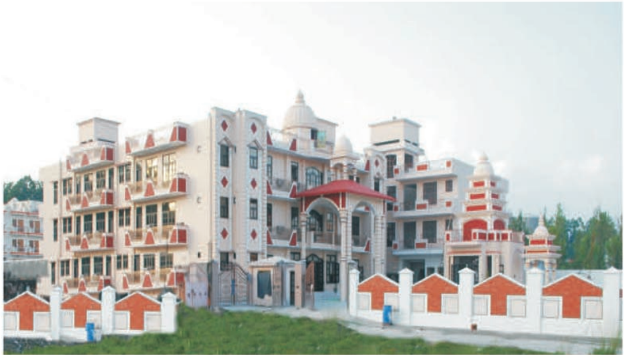
JUNG BHAVAN, BHUPATWALA HARIDWAR