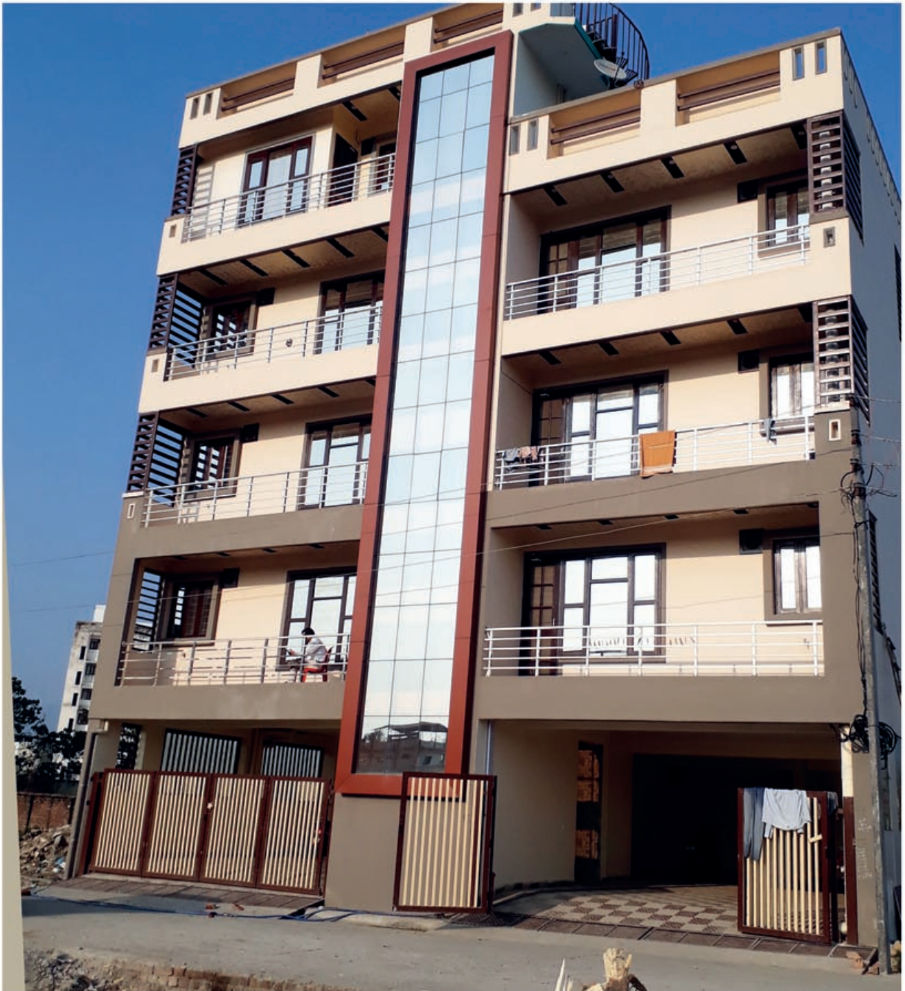
KRISHNA HOME - 7 OPP. DOON MEDICAL COLLAGE, DEHRAKHAS DEHRADUN