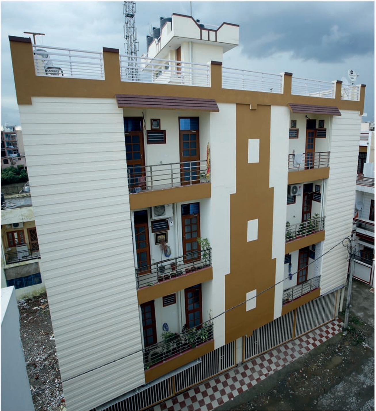
KRISHNA HOME - 8, Block No.: 52, THDC COLONY, DEHRAKHAS - DEHRADUN