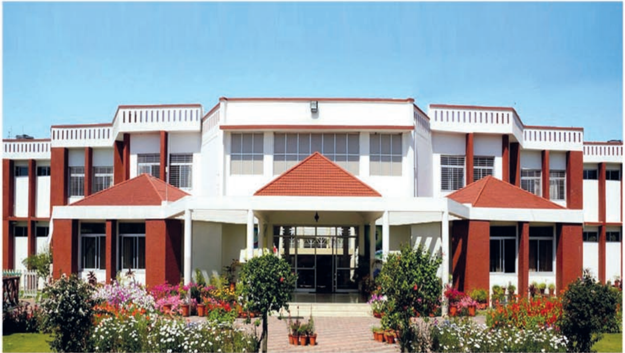
DELHI PUBLIC SCHOOL SECTOR-4 , HARIDWAR