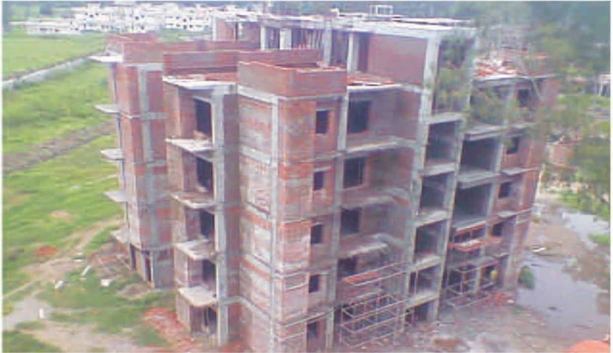
AIIMS - RISHIKESH