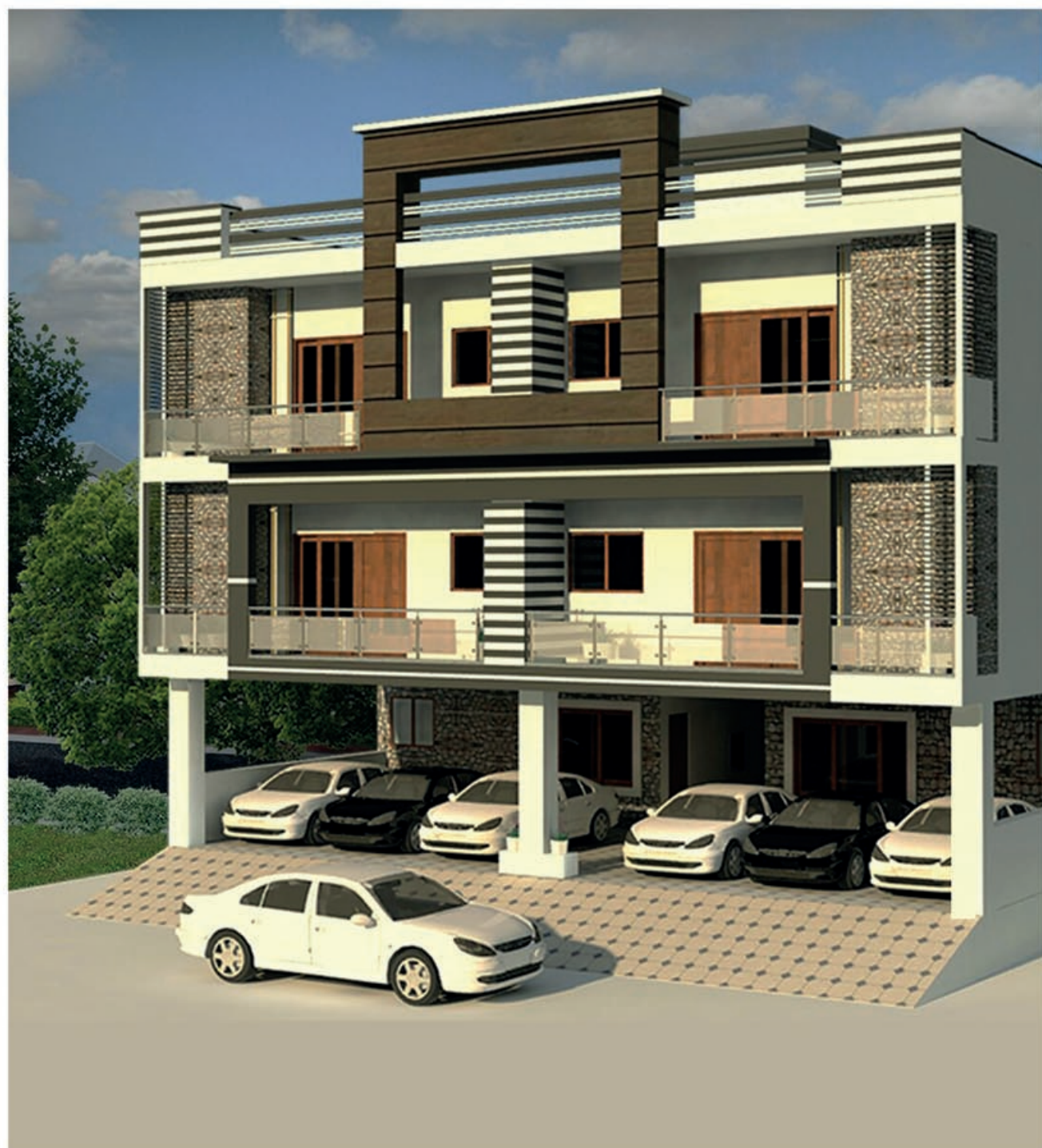
KRISHNA HOME - 5 AT BLOCK NO. 64 THDC COLONY DEHRAKHAS, DEHRADUN