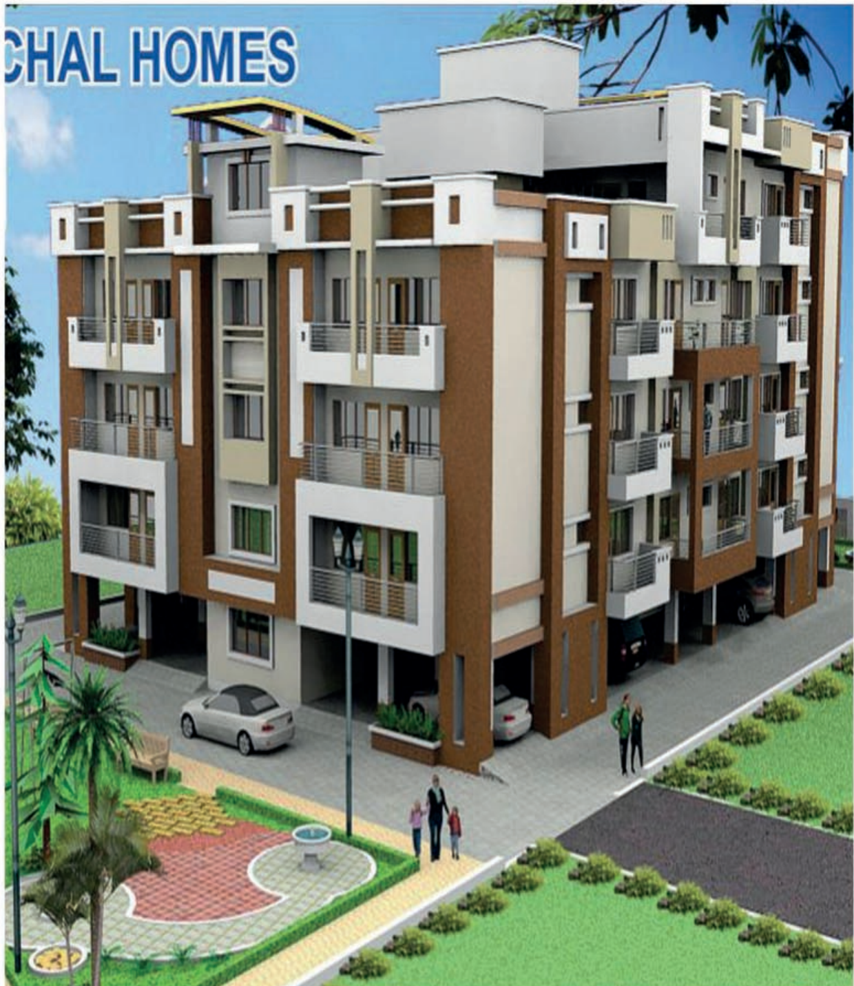
NISHCHAL HOME AT CANAL ROAD, DEHRADUN