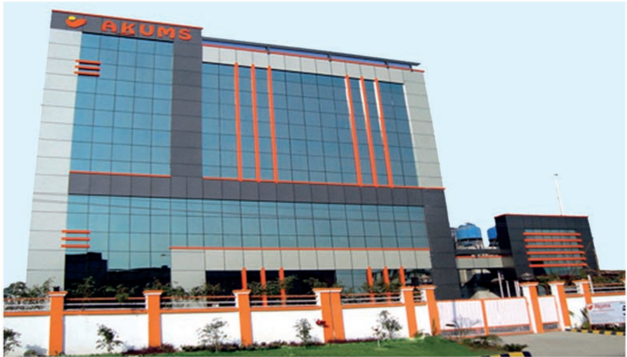
AKUMS DRUGS Pland - II, SIDCUL, HARIDWAR