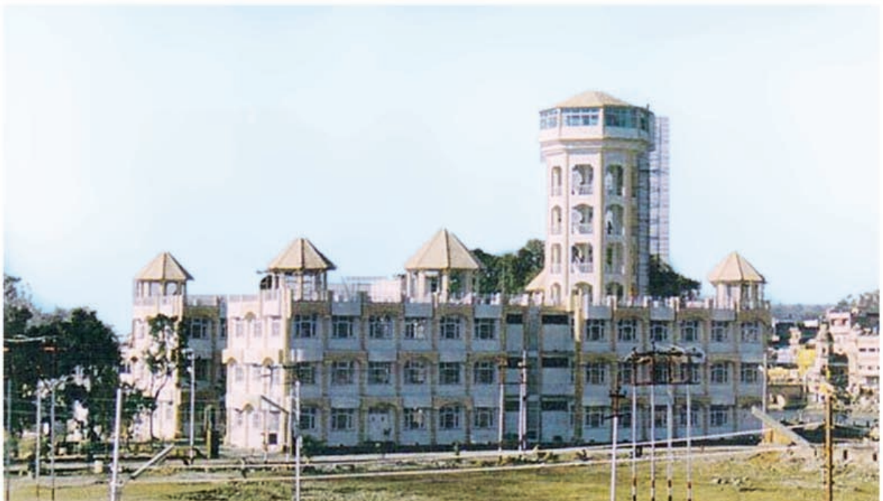
POLICE CENTRAL CONTROL ROOM AT LALJIWALA, HARIDWAR