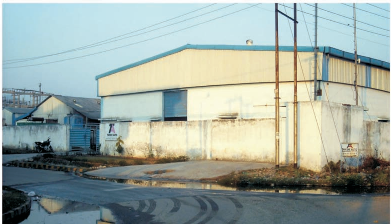
TAKSHI AUTO COMPONENT, SIDCUL RANIPUR, HARIDWAR