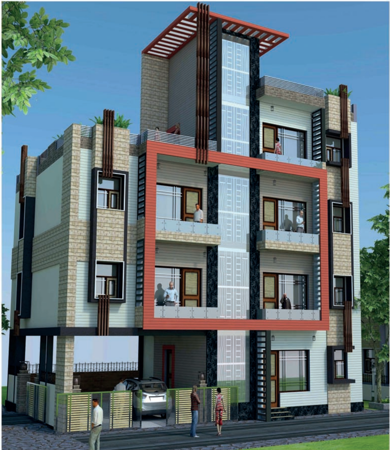
KRISHNA HOMES - 4 MULTISTORY BUILDING AT BLOCK NO. 54 THDC COLONY, DEHRAKHAS, DEHRADUN (AS A DEVELOPER)